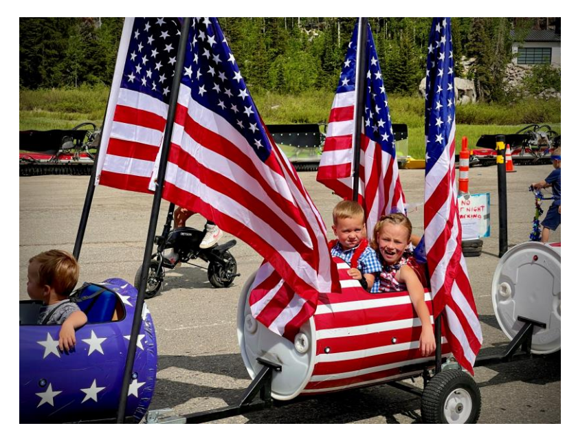
BRIGHTON BREAKFAST & PARADE THURSDAY • JULY 4 • 2024

8-10:30 am Breakfast at the Milly Chalet featuring the Music of Dave McCormick