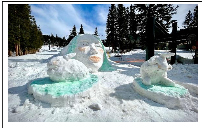
Mother Earth and the Snow Bunnies Snow Sculptures from Brighton's Winter Fest - April 2022