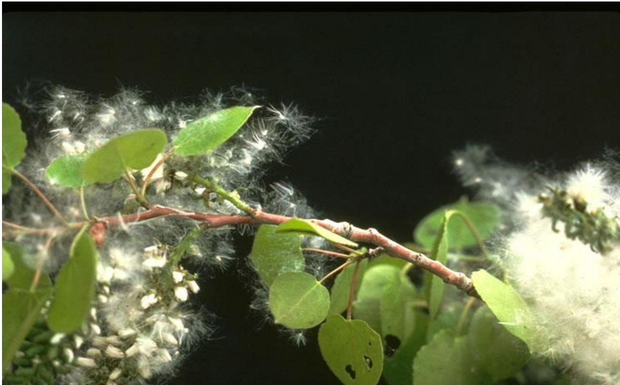
Springtime Aspen catkins in Big Cottonwood Canyon

It's no wonder that the State Tree of Utah is the Aspen!