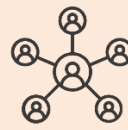
Accessible Digital Content